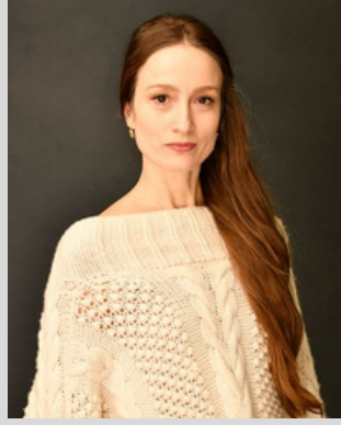
Julie Kent Artistic Director