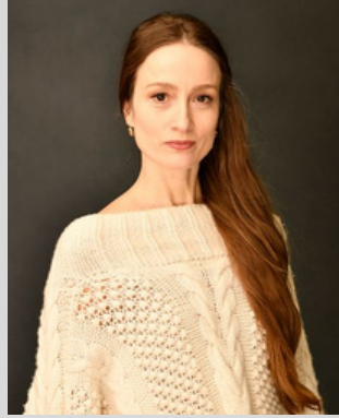
Julie Kent Artistic Director