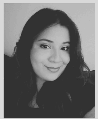
Angela Flores Academy Student Support Coordinator